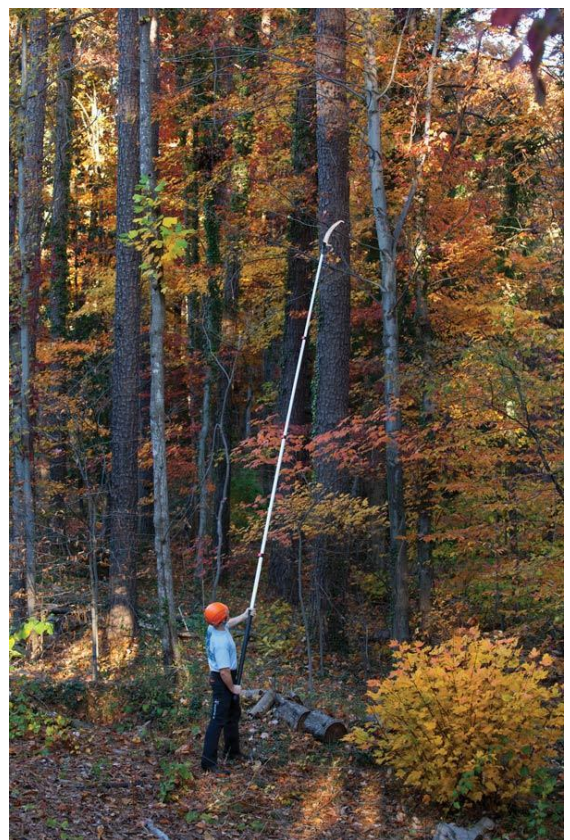
The Hayauchi hard at work. Also pictured: some guy who is probably going to take all the credit.

Cutting big limbs 20' above your head can be dangerous, so you might want to pick up a hard hat when you're ordering your saw. Gravity is a heck of a thing.