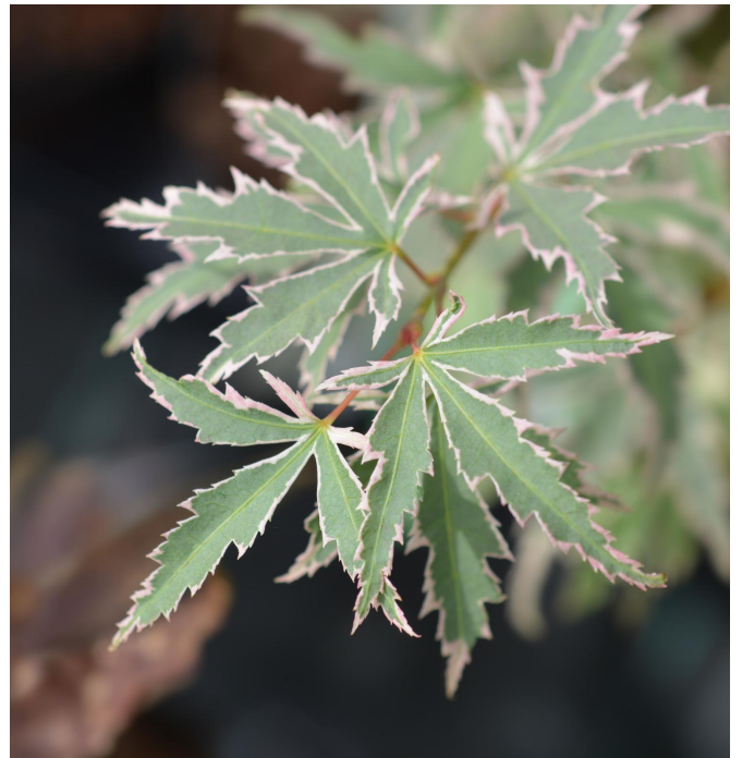
Some leaves will have more green, while some will have more white. The older the tree becomes, the more the white tends to dominate.

The leaves are on the small side, but make up for their size by putting on a colorful show throughout the year. Spring growth is a mix of pink and green. As the leaves mature, that pink color fades to a creamy white. The green and white variegation holds through the summer, before the tree turns a mix of magentas and reds in autumn.