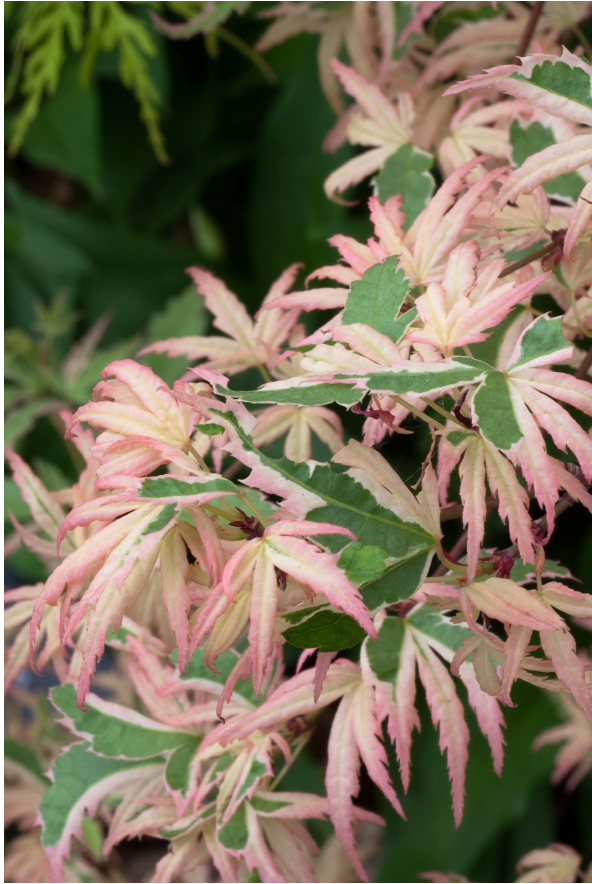
Spring pink on 'Butterfly' doesn't stick around for long, but it's great while it lasts.

Like most dwarf Japanese maples, 'Butterfly' is dense, with lots of small branches covered in lots of those small variegated leaves.