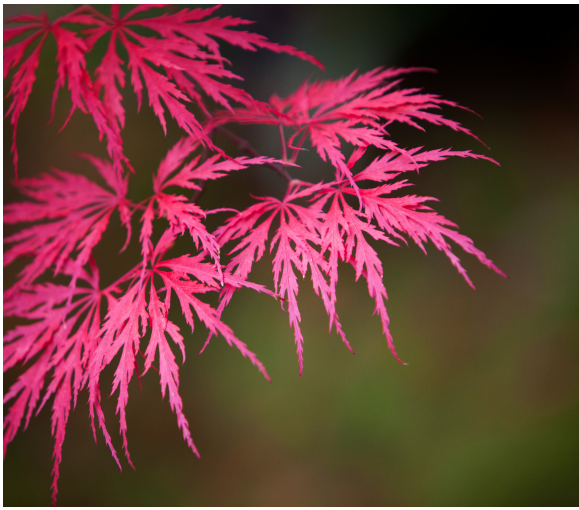
It's hard to find a pretty picture of someone fertilizing a tree. So, here's a lovely picture of 'Seiryu' leaves in autumn.