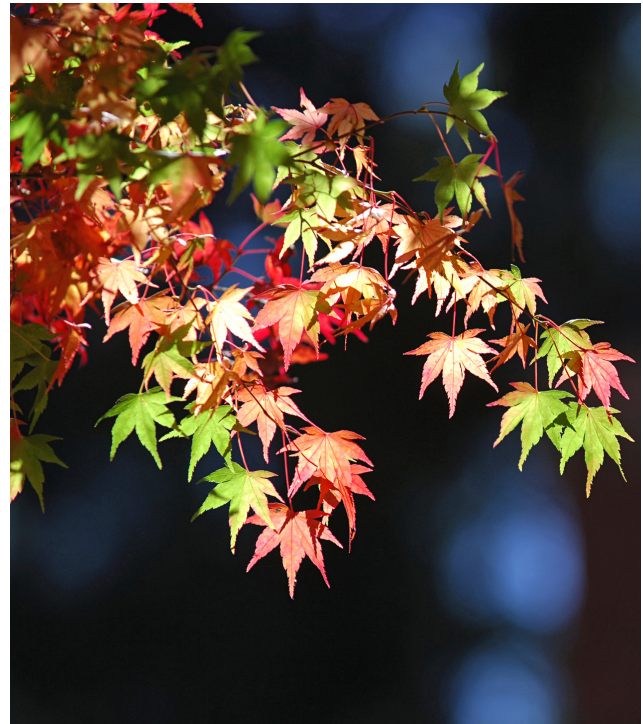
Early fall color on Acer palmatum . Not pictured: The gardener that has no doubt taken great care of this Japanese maple by not over-fertilizing it.

You can also fertilize them more often than the Japanese maples. An application in March, one in May, and one in September should be sufficient.