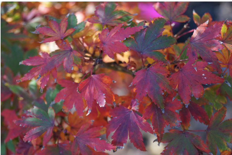
The many fall colors of 'Coonara Pygmy' run the full range from bright yellow to orange, red, magenta and even purple.

Most of the specimens we have available today are less than 4' tall and wide at present. We currently have trees in 1, 2, and 5 gallon sizes available for purchase.