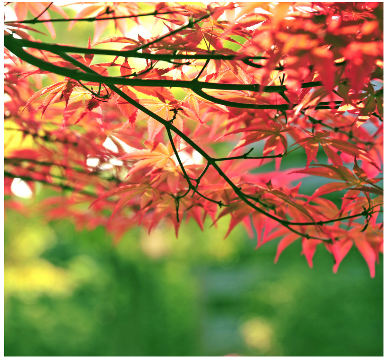
Going easy on the fertilizer will encourage better branching and the elegant shape most often associated with Japanese maples.

C: A balanced slow-release fertilizer like Osmocote at half the recommended rate on the package.