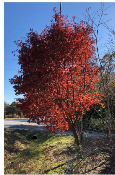
This big 'Fire Dragon' was one of many trees we dug and potted in January.

Metro Maples is a little over 6 acres, and is divided into several areas that are used for retail space, display gardens, and growing areas for both sun-loving and shade-loving trees. There are irrigation systems, fences, a koi pond, and heavy equipment and buildings that need to be maintained, so there's always plenty of work to do, and the cooler months are a great time to do it. That said, we'd much rather be talking to customers, so come on out and see us!