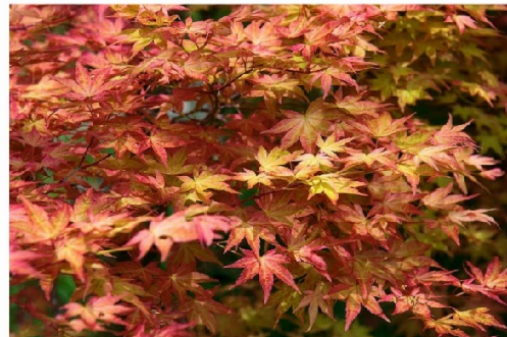
It's hard to describe all the colors you see in 'Shin deshojo' as it transitions from the bright ruby red of spring to the olive green of summer.

The shape of the tree is similar to the other upright cultivars, but it tends to spread out a little more quickly than the average Japanese maple. It's a relatively small tree, but with an open, airy structure that works elegantly as an understory tree. It provides a bright and colorful focal point in a garden without being too overwhelming.