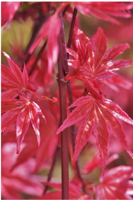
Spring color on 'Shin deshojo'. This variety is always among the brightest reds on the farm in springtime.