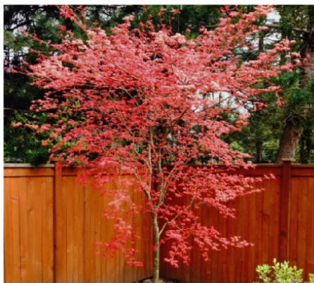
This 'Shin deshojo' is in spring color. This image gives you a nice idea of the mature shape and size of this outstanding cultivar.

There are several other cultivars that perform similarly to 'Shin deshojo' and we have many of them in stock. 'Bonfire', 'Deshojo', 'Corallinum', and 'Beni maiko' are just a few examples.