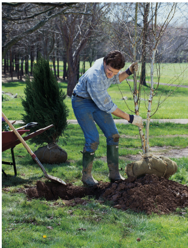
Not sure what he said to offend the family but now there's nobody there to call for an ambulance and the tree still isn't in the hole. Unsurprising, as his technique ranges from 'poor' to 'quite poor.'

This isn't to say that spring is a bad time to plant trees -- just that it isn't as perfect as the fall.