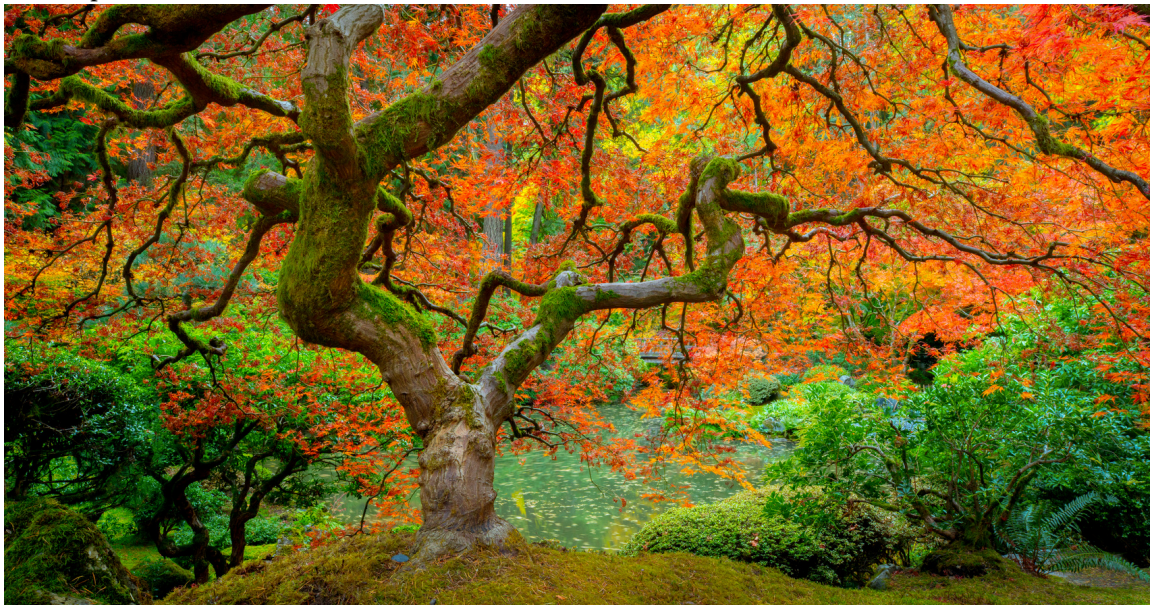
This is a deceptively photographed (it's actually only about 8' tall) but lovely maple in the Portland Japanese Garden. This is one of the most photographed Japanese maples in the country if not the world. Whoever planted this one did a great job. No complaints here.

When planting this time of year there's no need to fertilize, and no need to apply any root stimulator products. The tree will root out just fine on its own, and will be well-equipped to handle the upcoming growing season!