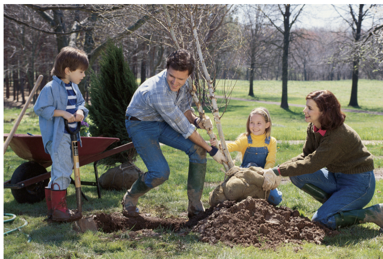
Illustrated above: a pretty good way to meet a local orthopedic surgeon. We'd advise you to not do any of this.

The more roots the tree is able to grow, the better it can absorb water and nutrients from the soil, and the stronger and healthier it can grow in the spring and summer.