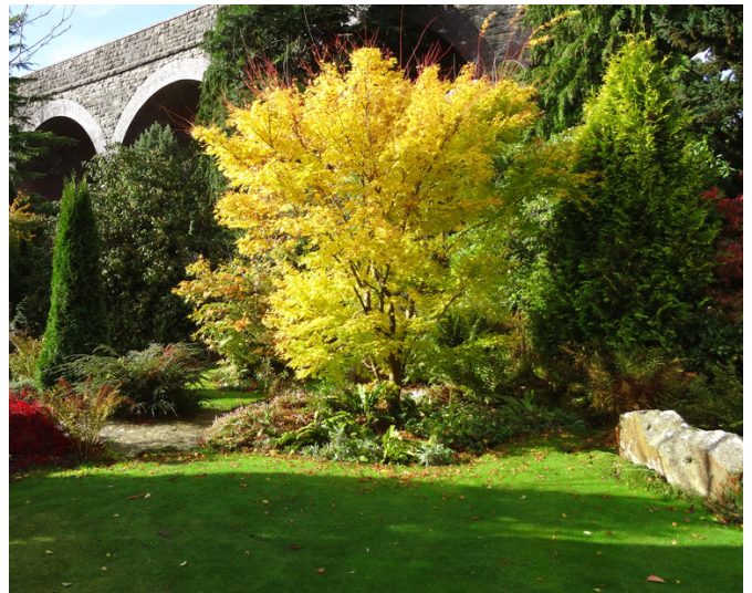
Fall color on the coral bark maples tends to be a bright yellow, which in some years can deepen into oranges and reds late in the season.

'Winterflame' is a bit slower growing 6' tall.