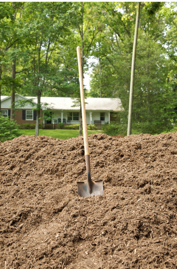
This is an illustration of 'organic matter' that you might use to amend the soil when planting your maple.

The hole you dig should be 50% wider than the root ball, and not quite as deep. A wider shallow hole is preferable to a narrow, deep one.